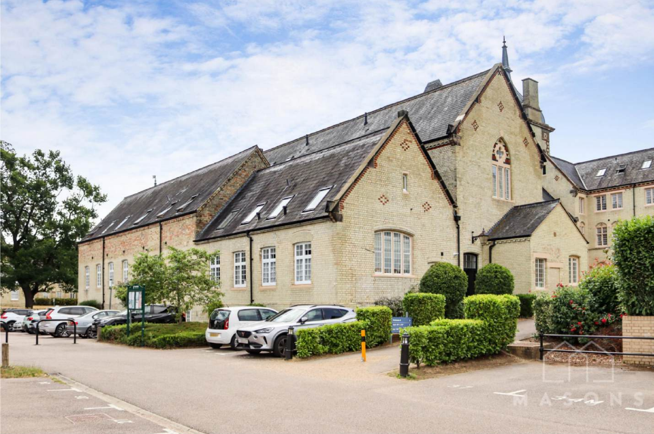
Hertfordshire Wing, Fairfield Hall, Stotfold, Hitchin, Hertfordshire, SG5