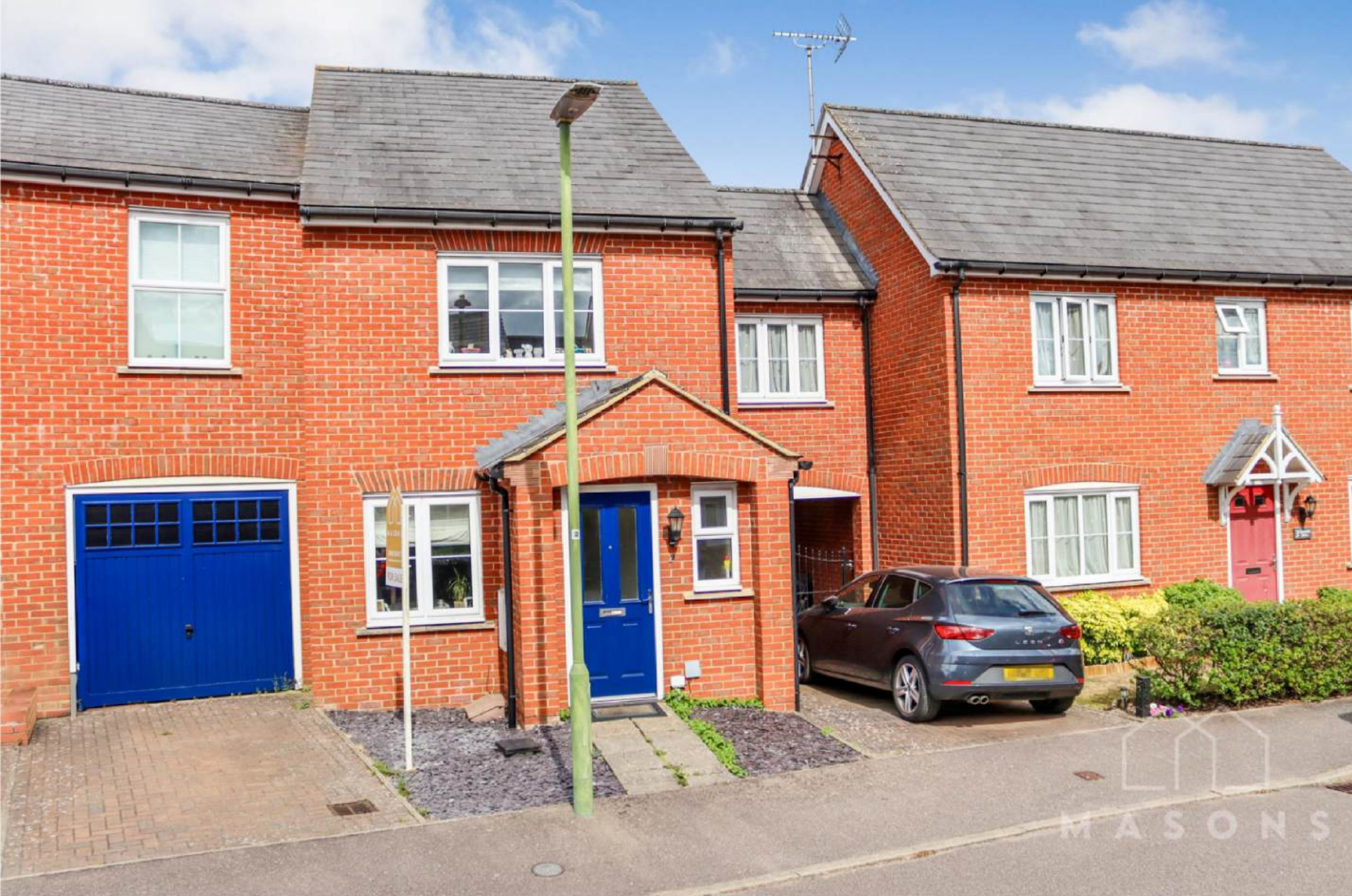
Cotswold Drive, Stevenage, Hertfordshire, SG1